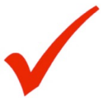
Exhibit Booth Includes:

Booths highlighted in yellow are considered PRIME locations